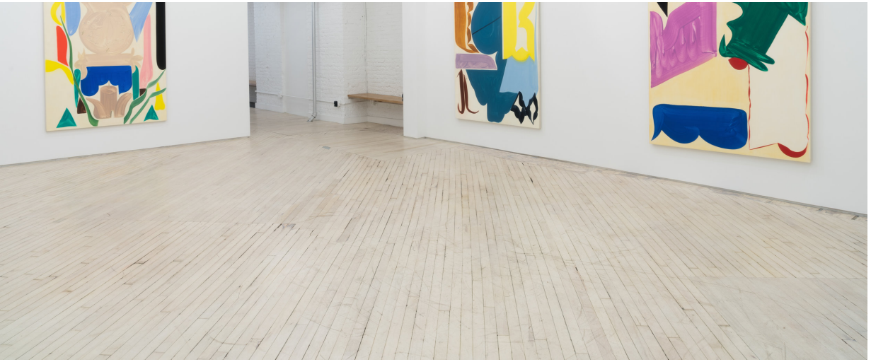
Exclusive interview conducted by Timothy Hull for Aujourd'hui.