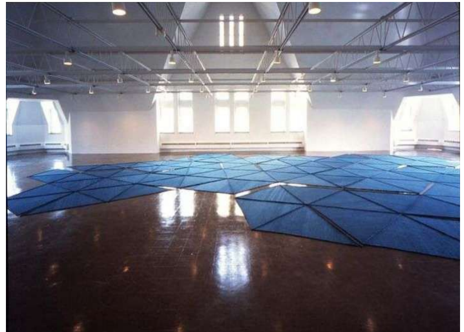
Detail of Sky-wreck, 2001.

Some of the Zen ancestors recognized weaving as relevant. In the Mountains and Rivers Sutra , Dogen writes of the horizontal and vertical, which I read as a description of the simultaneity of relative and absolute reality of the fundamental sublime. Hongzhi had been a bit more romantic about it, describing brocade, gold, and jade. If I had the opportunity to offer a verse responding to his verse for the first case in the Book of Equanimity , it would be: Often walking, loom and shuttle.