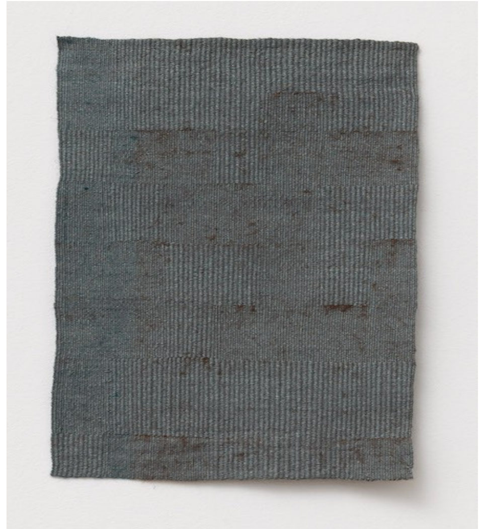
March–April, 2018.

BDG: Also, there are times when you invite others to join you in the walking, adding a participatory element reminiscent of Thich Nhat Hanh. How did inviting others to join you in places such as the New York High Line feel? What did this add to your experience of walking by yourself?