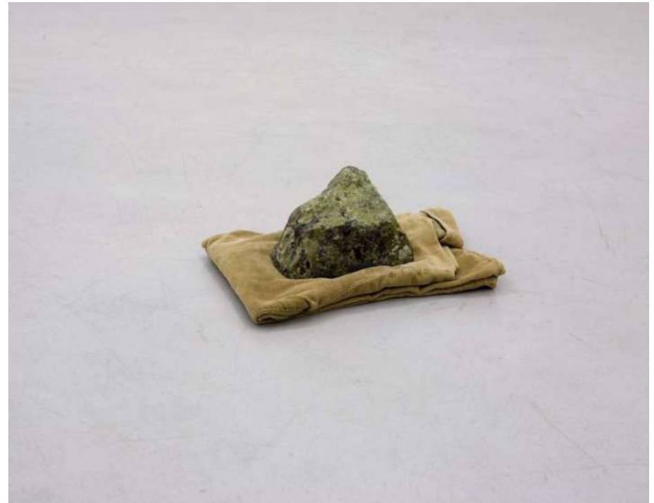
Mantle, 2007.

hm: Hmm . . . I have no formal training. Maybe my first guide was a Thelonious Monk vinyl record that I chose to borrow from the library when I was 11 or 12, because of the photograph of him on the cover—I think it somehow registered that he was foremost a listener, and that this is what a great musician is. Maybe I could feel, even though I didn't know it at the